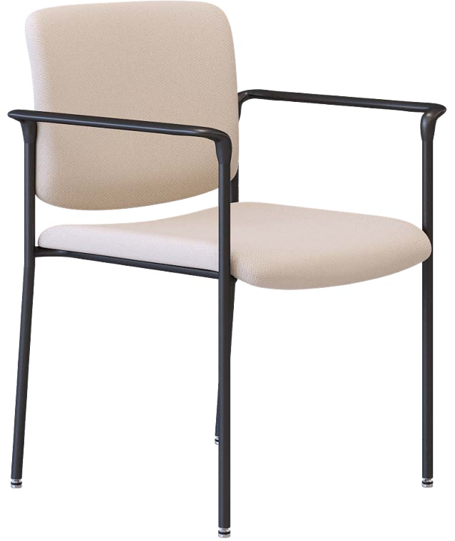
502 DESIGNER III COLLECTION THEORY | THRY017 | Stone