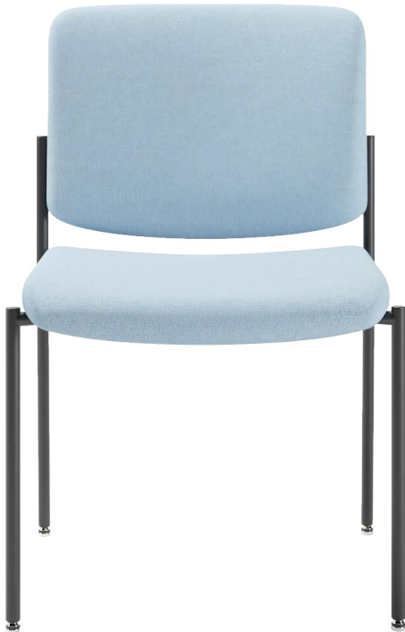
Cricket II 503 Heavenly (Cornflower)

The Cricket II is our 'everything chair.' Practical, durable, stackable, and comfortable, it serves a wide-range of functions and spaces. No matter your need, the Cricket II will surpass it.