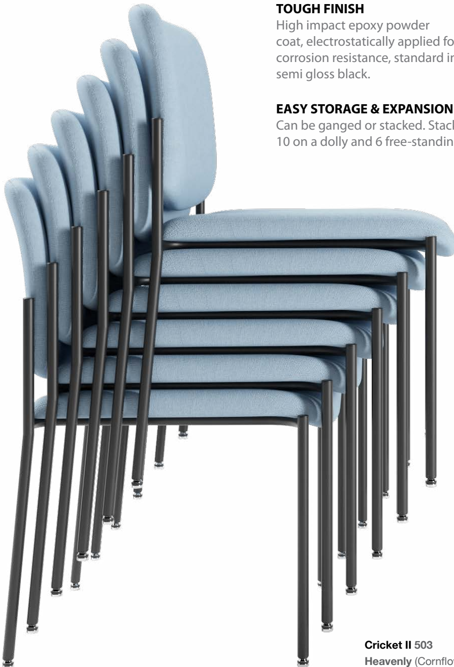
Cricket II 503 Heavenly (Cornflower)

Waterfall seat design to reduce muscle fatigue.