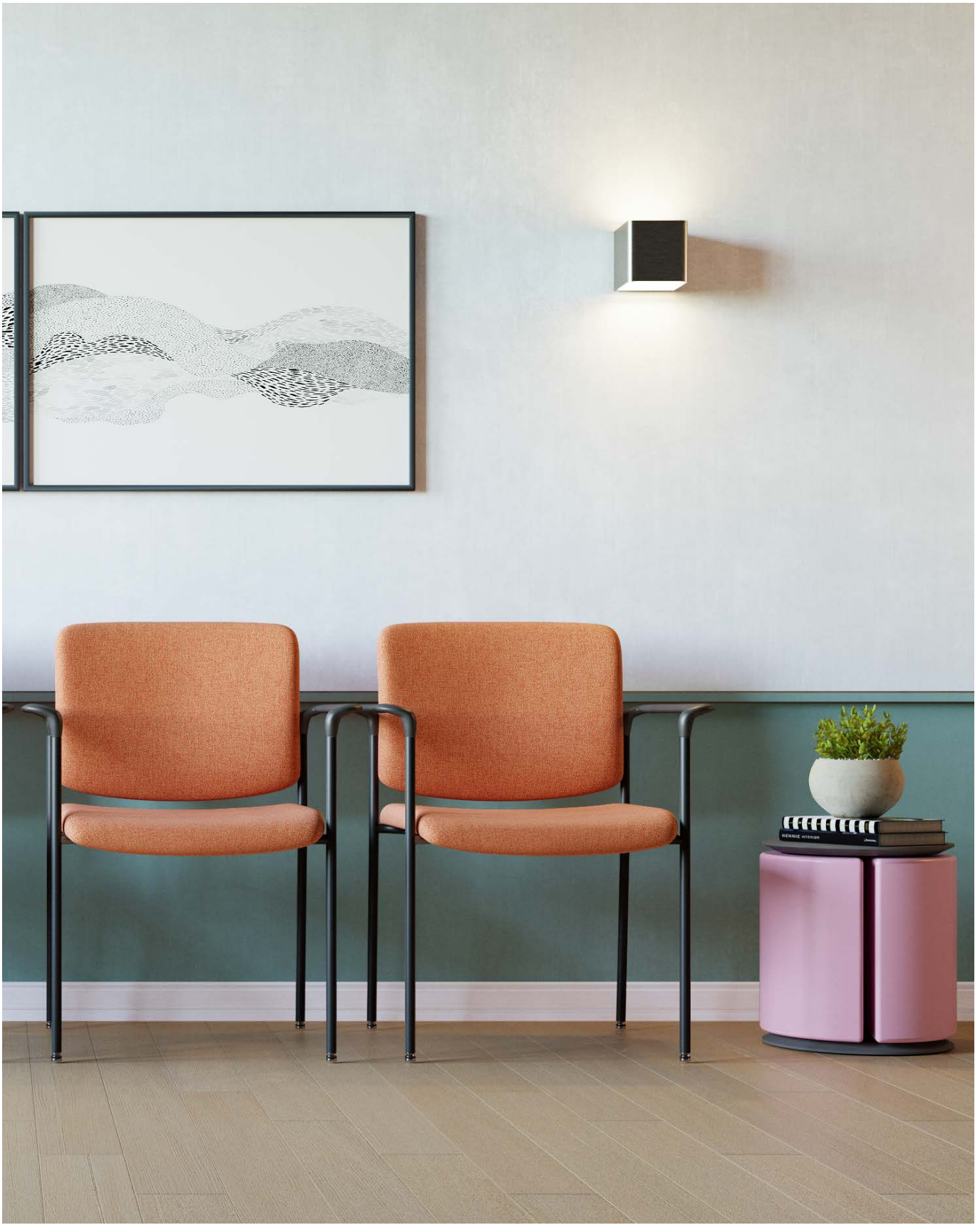
Cricket II 502 Fedora (Tangelo)