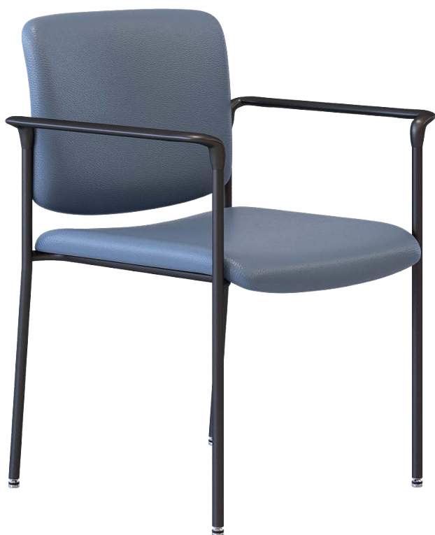
502 DESIGNER II COLLECTION CARESSA | CAR064 | Cerulean