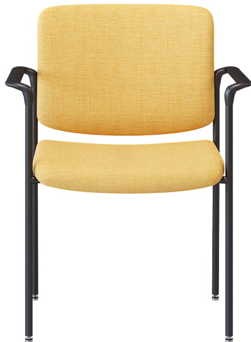
Cricket II 502 Mingle (Straw)

The lack of armrests in the 503 model make it a freer sit, providing more range room for multi-use functions.