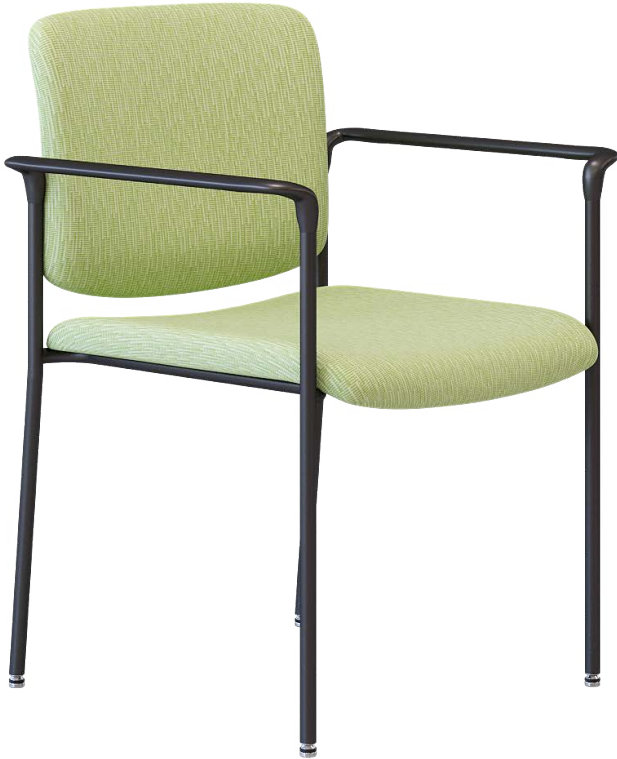
502 DESIGNER II COLLECTION RUMBA | RUMB003 | Lime

The Cricket II can be upholstered with any of our high-quality textiles, vinyls, or leathers. Customize your chair with our wide range of colors and grades on My Chair Maker: nightingalechairs.com/my-chair-maker