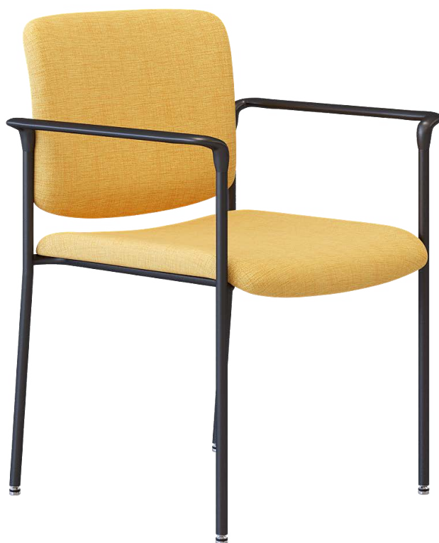
502 DESIGNER II COLLECTION MINGLE | MGL002 | Straw